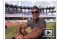
Talking point: Milind Soman