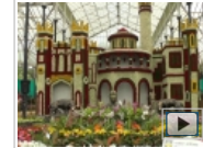
Lalbagh Flower show: A Floral tribute to...