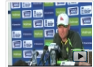
Clarke announces retirement after final Ashes test...

Subscribe - Deccan Herald's YouTube channel